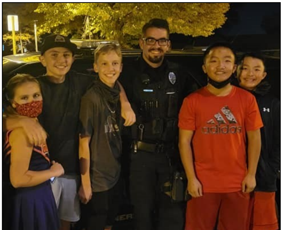
Bike Safety Event at Malley Drive Elementary